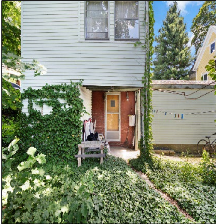
Right: Right Elevation